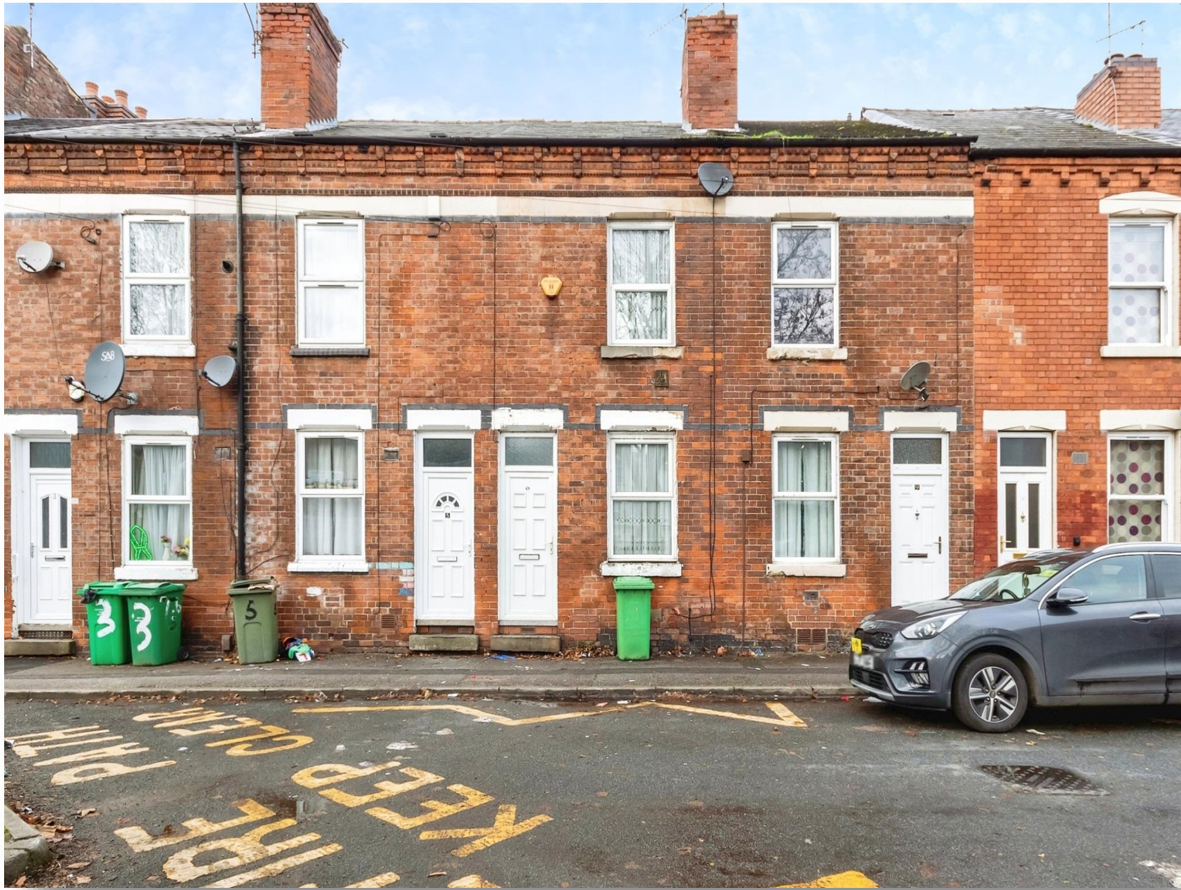
Bridlington Street, Nottingham NG7 5BG