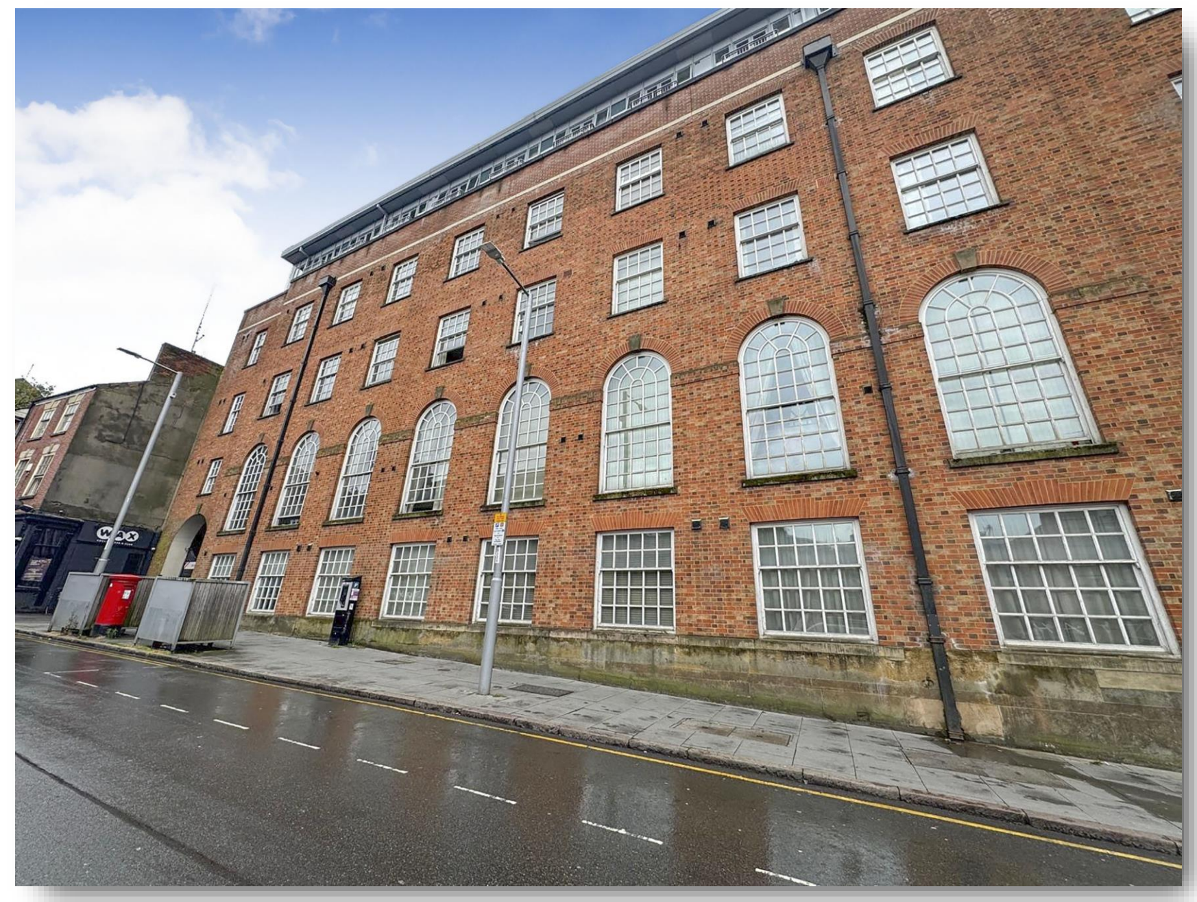
Castle Exchange Broad Street, Nottingham NG1 3AP