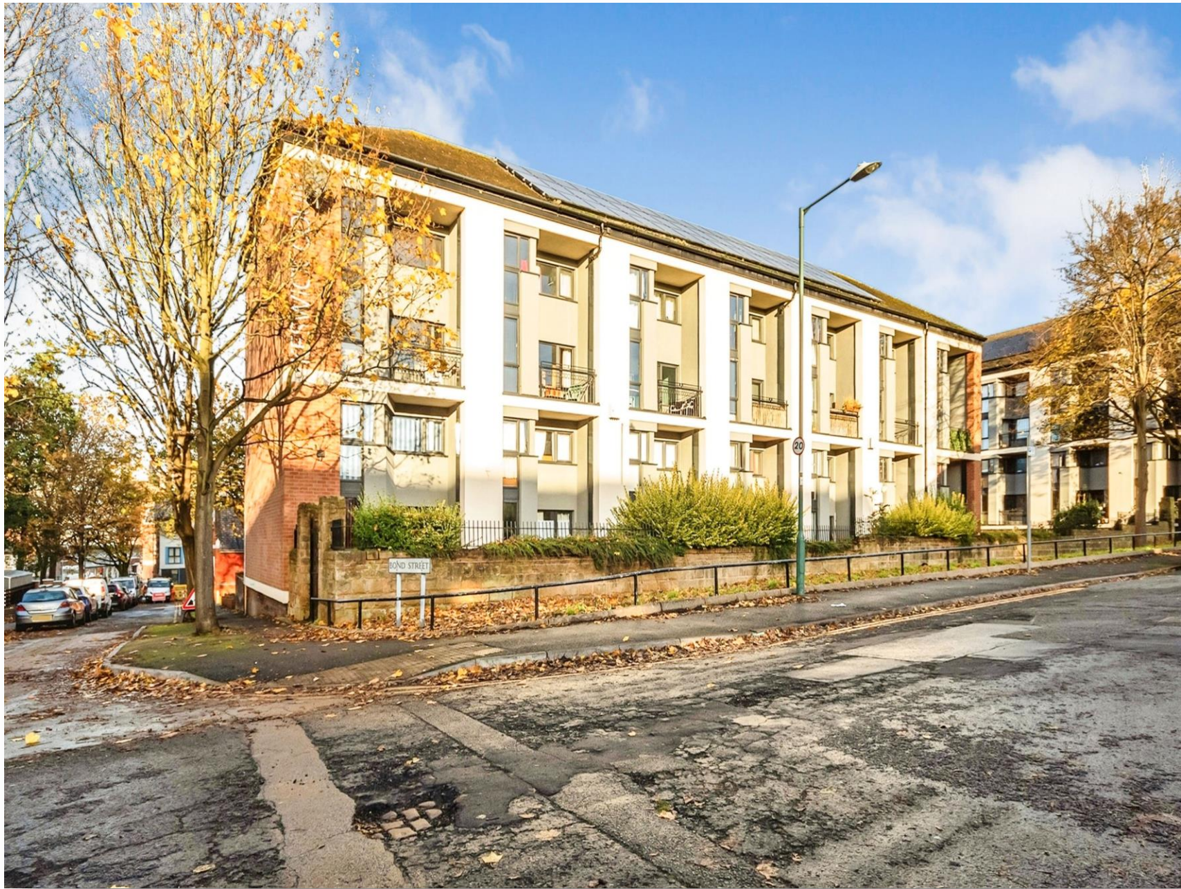
Keswick Court, Nottingham NG2 4PZ