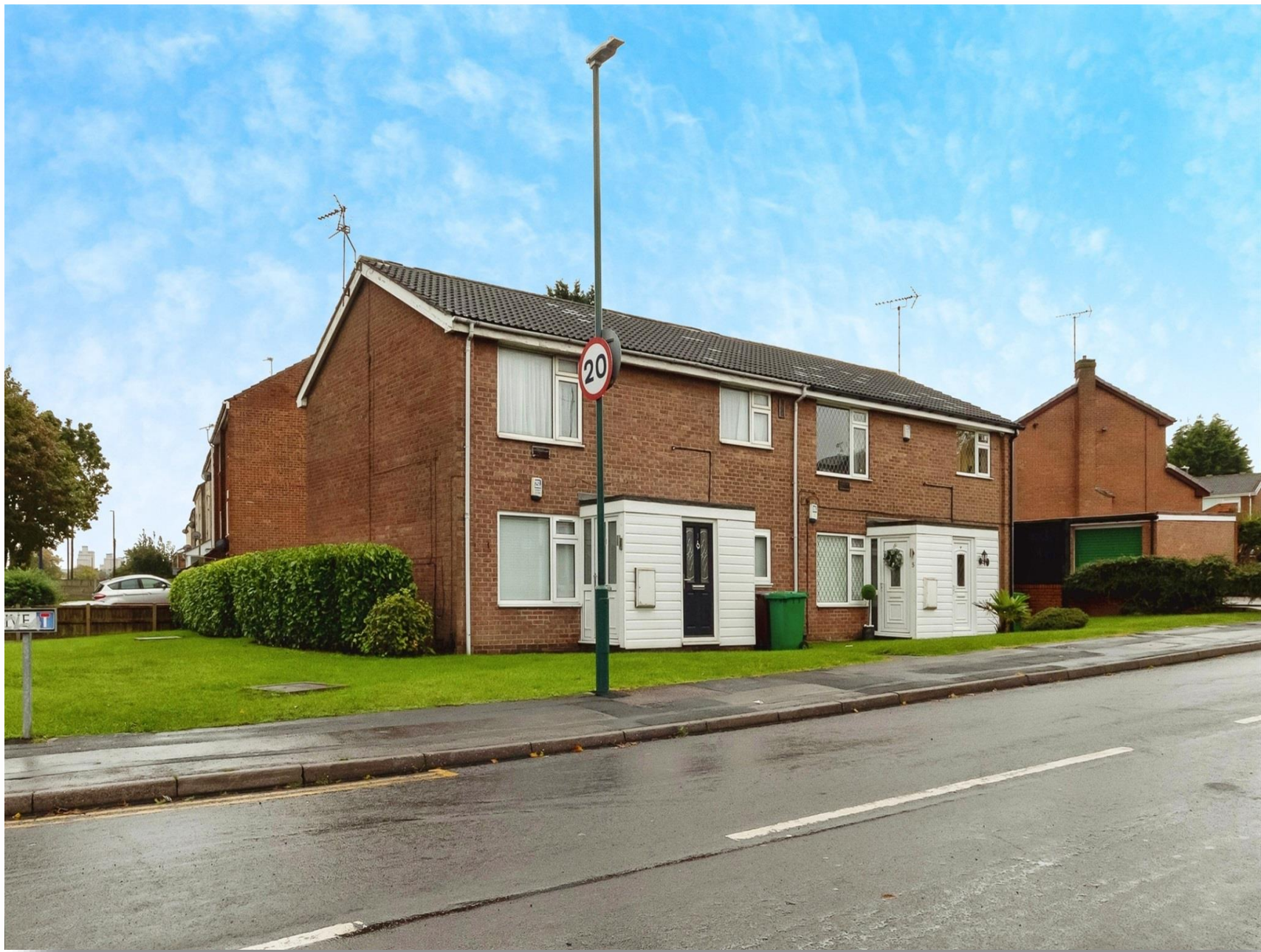
Staindale Drive, Nottingham NG8 5FU