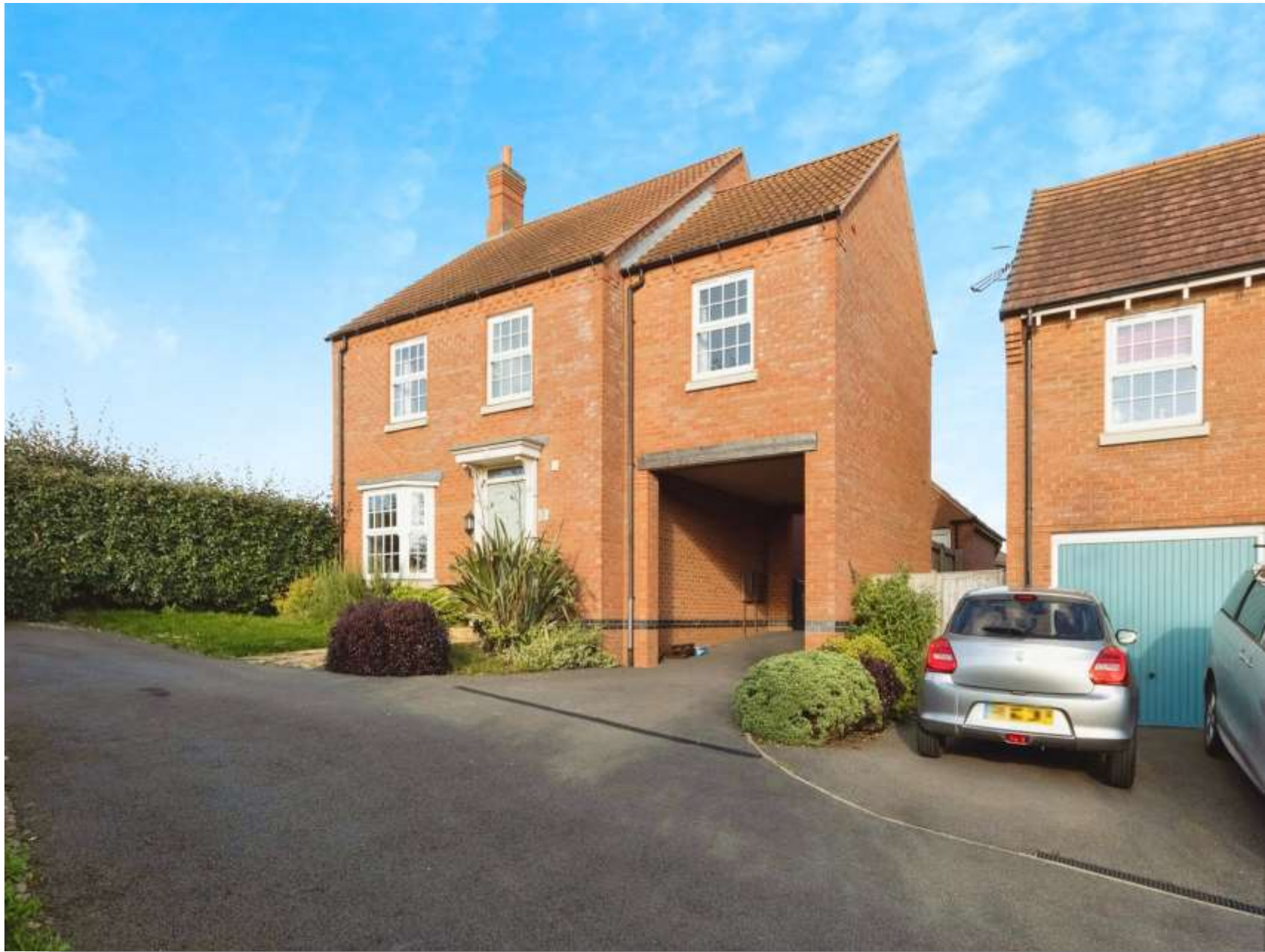
Ellington Road,Arnold NOTTINGHAM NG5 8SJ