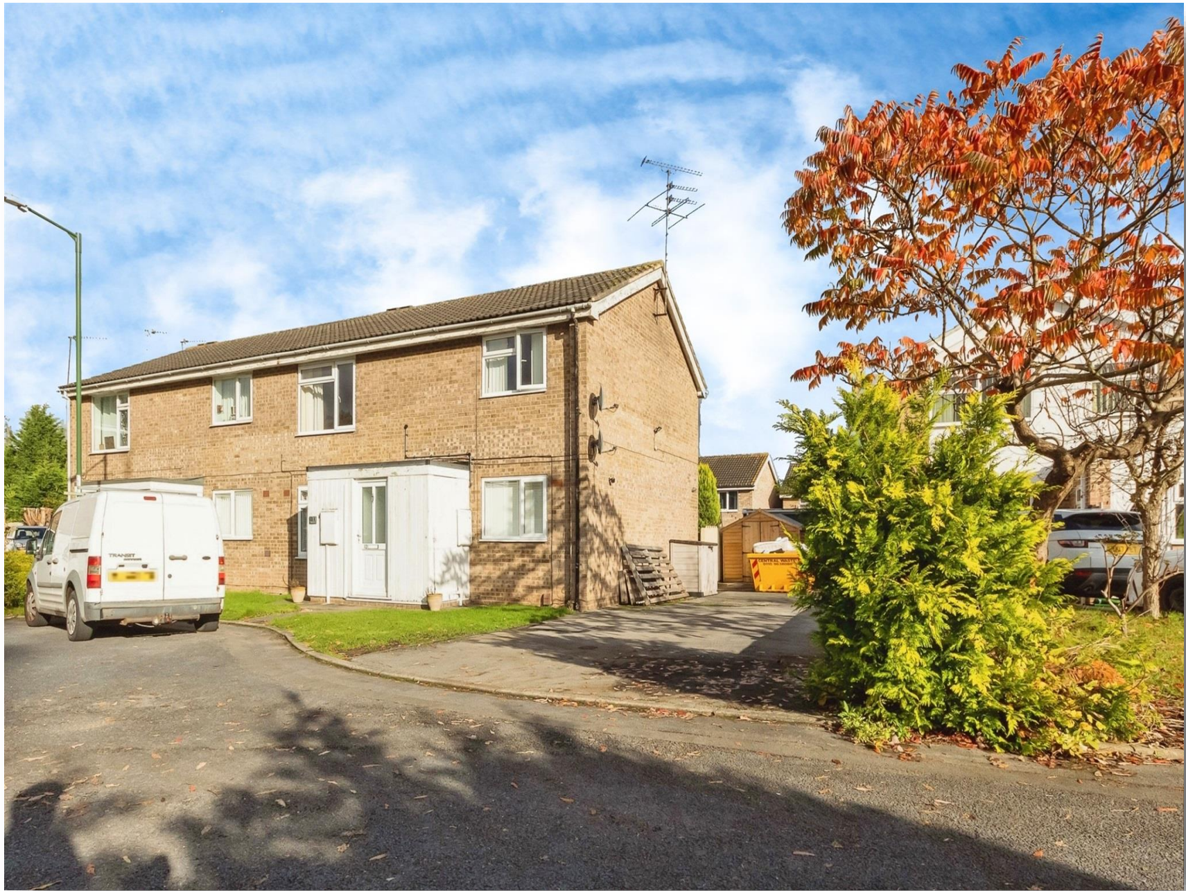
Staindale Court, Nottingham NG8 5FZ