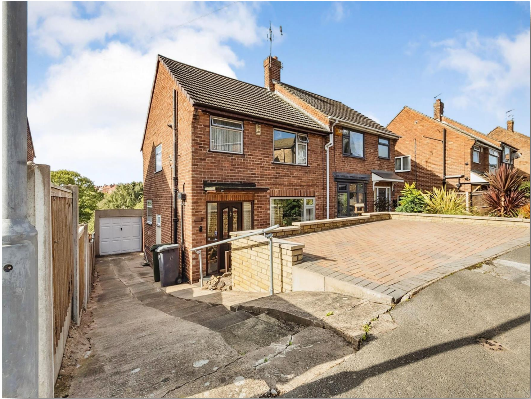
South View Road, Carlton Nottingham NG4 3QL