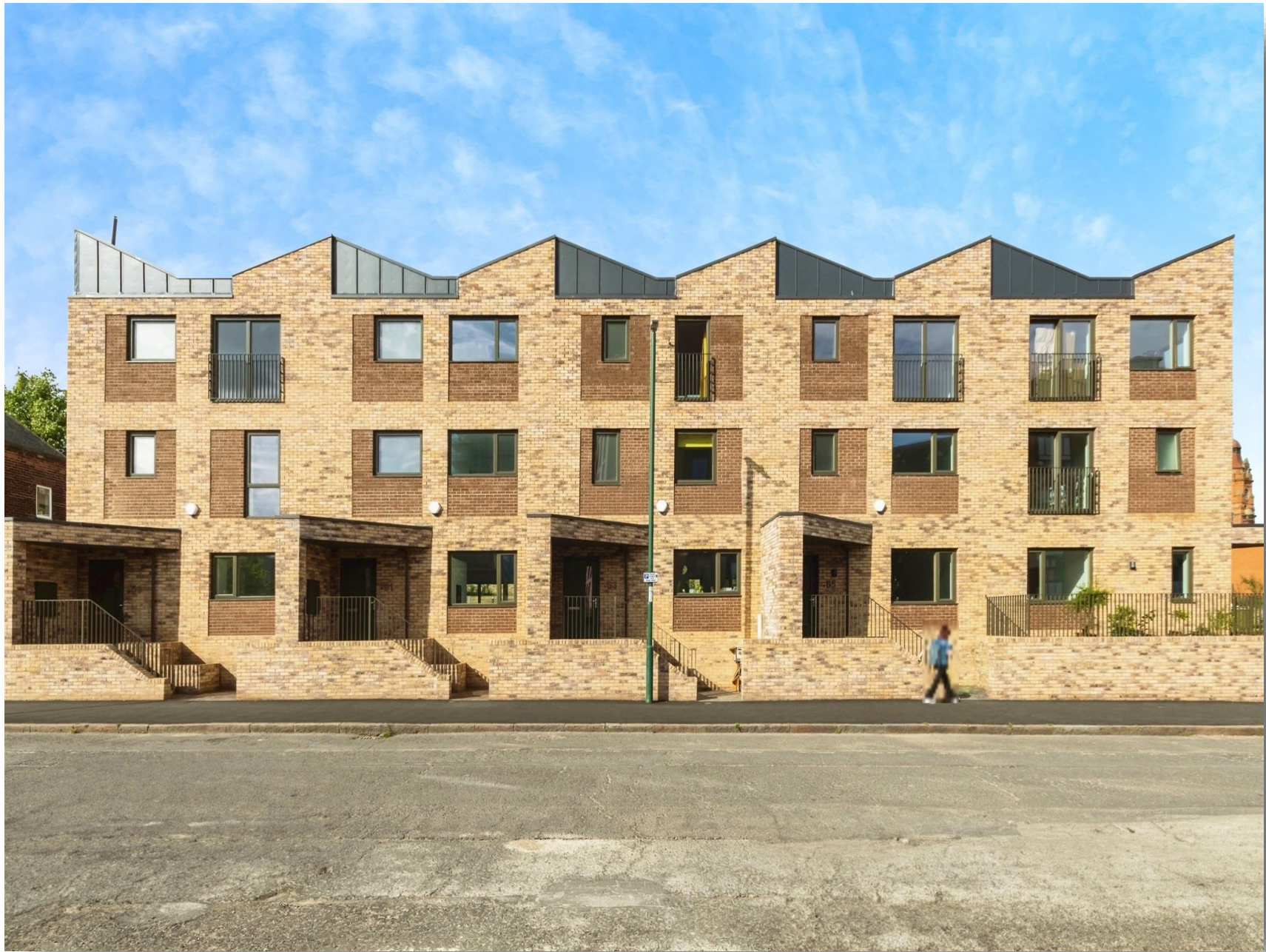
The Fruit Market, Nottingham NG1 1EA