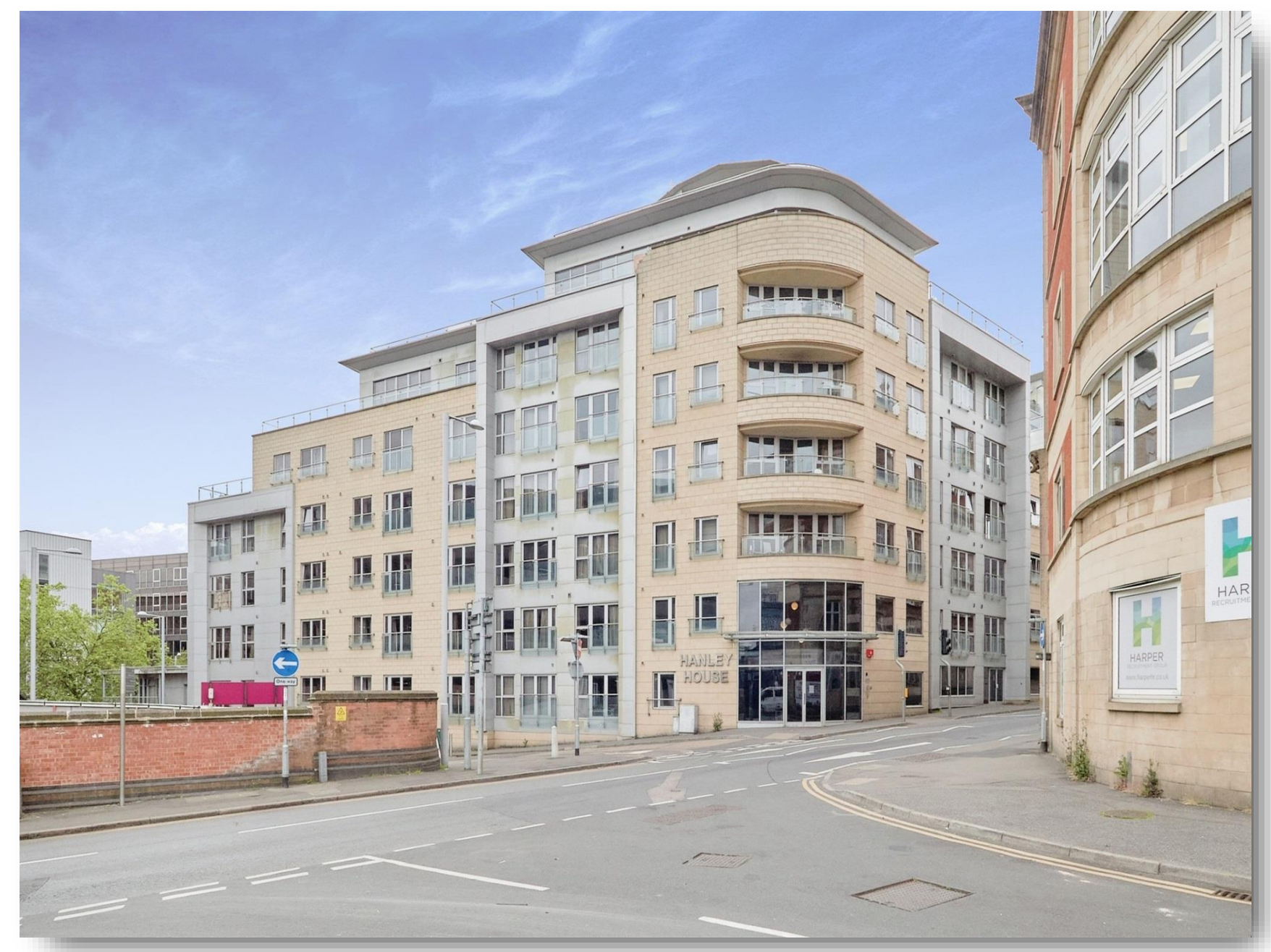
Hanley House Hanley Street, Nottingham NG1 5GD