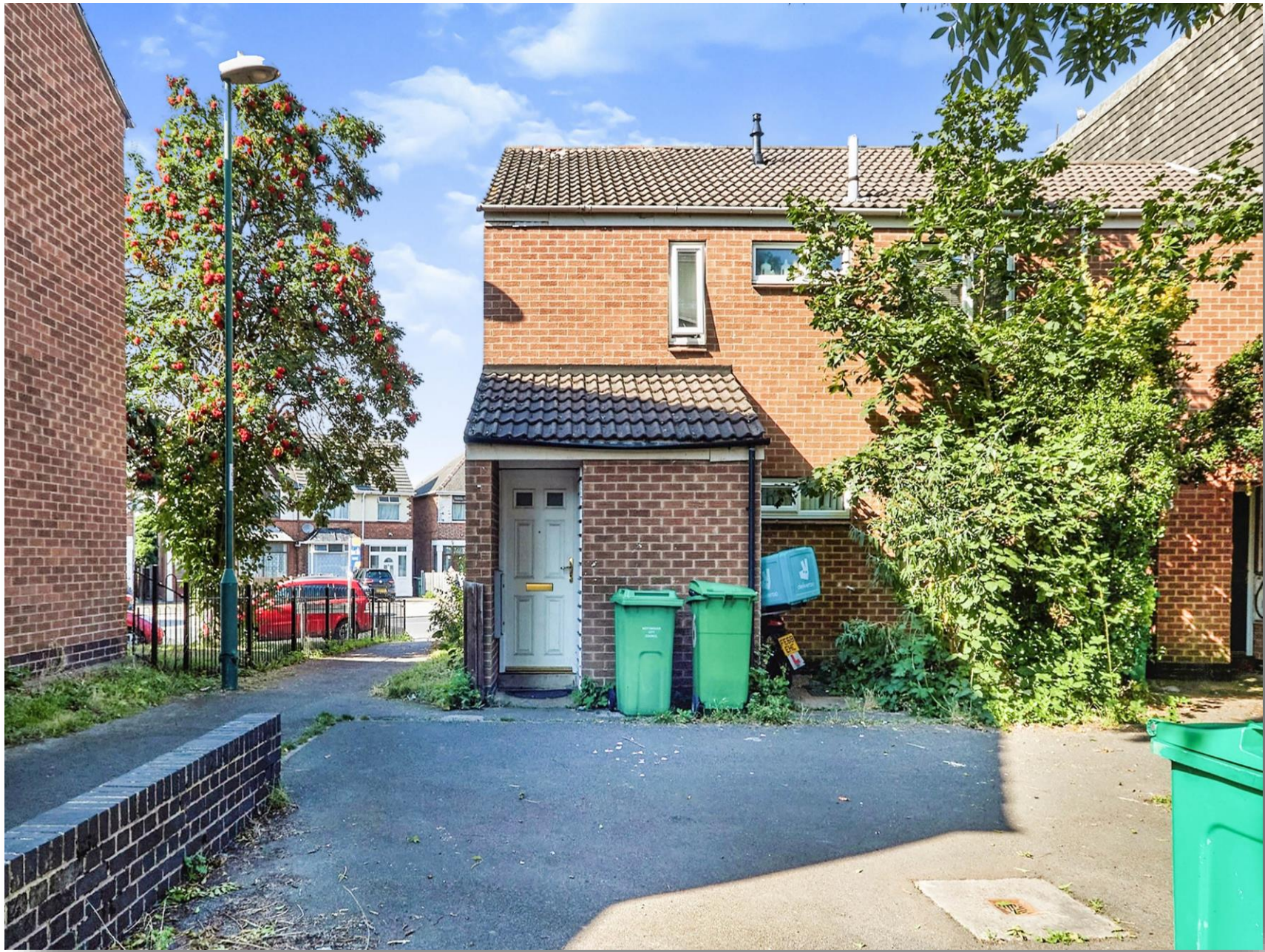
Camomile Gardens, Nottingham NG7 5GB