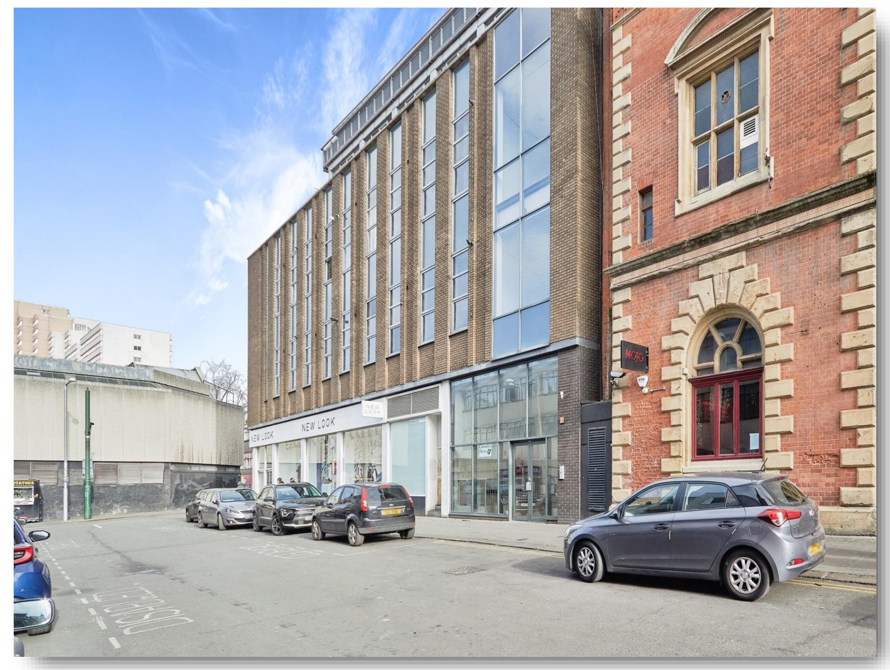
Crusader House Thurland Street, Nottingham NG1 3BT