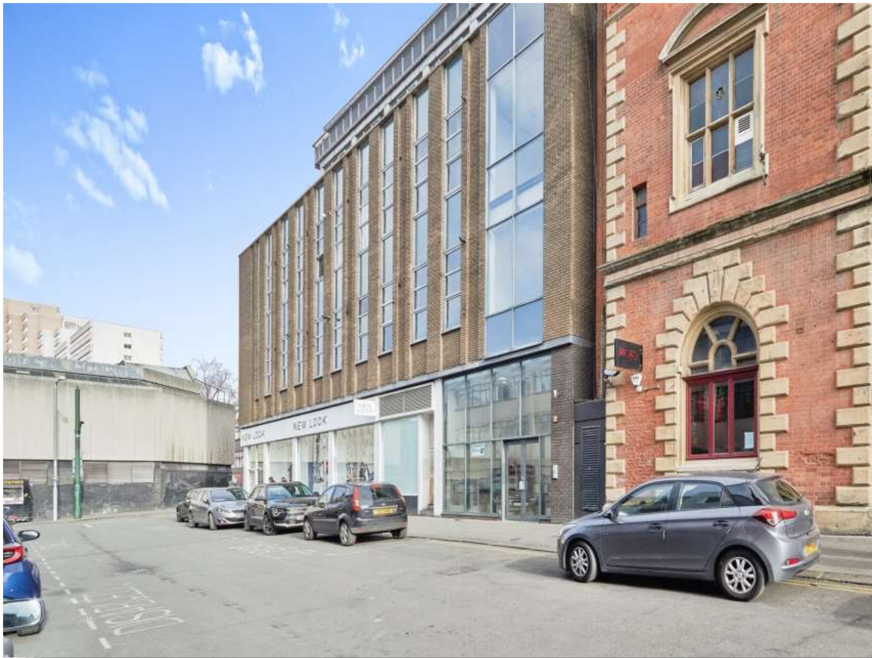
Crusader House Thurland Street, Nottingham NG1 3BT