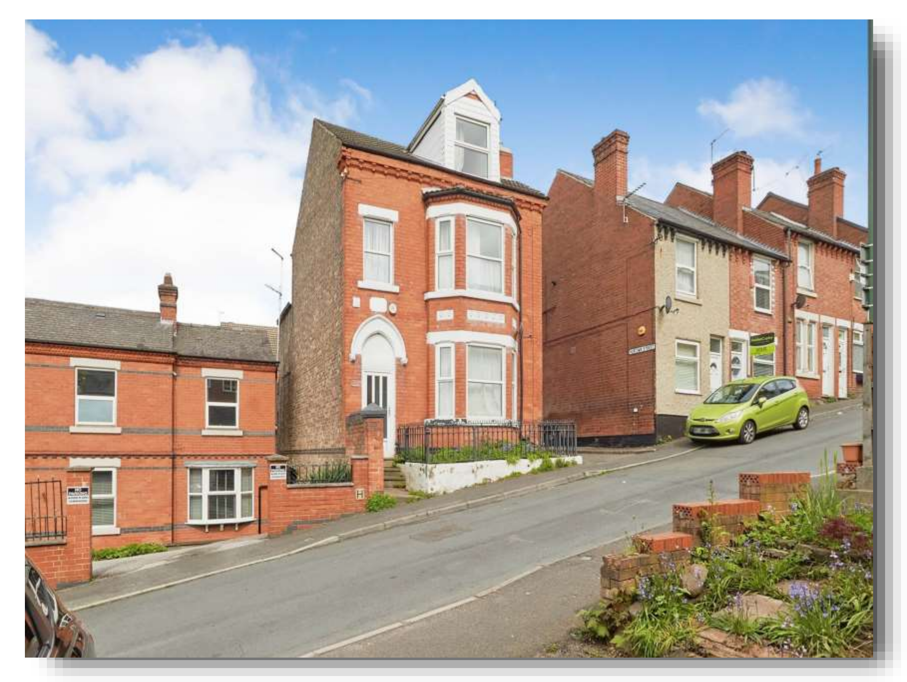
Ball Street, Nottingham NG3 3AX