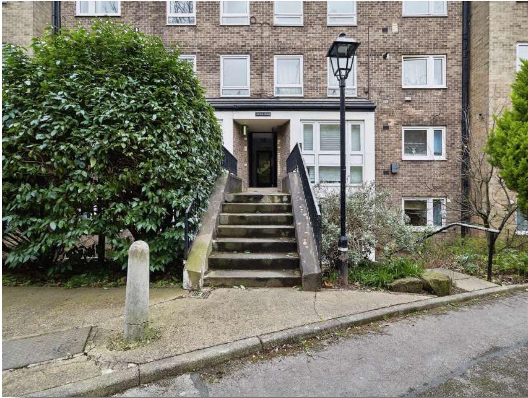
Lincoln House Redcliffe Road, Nottingham NG3 5AT