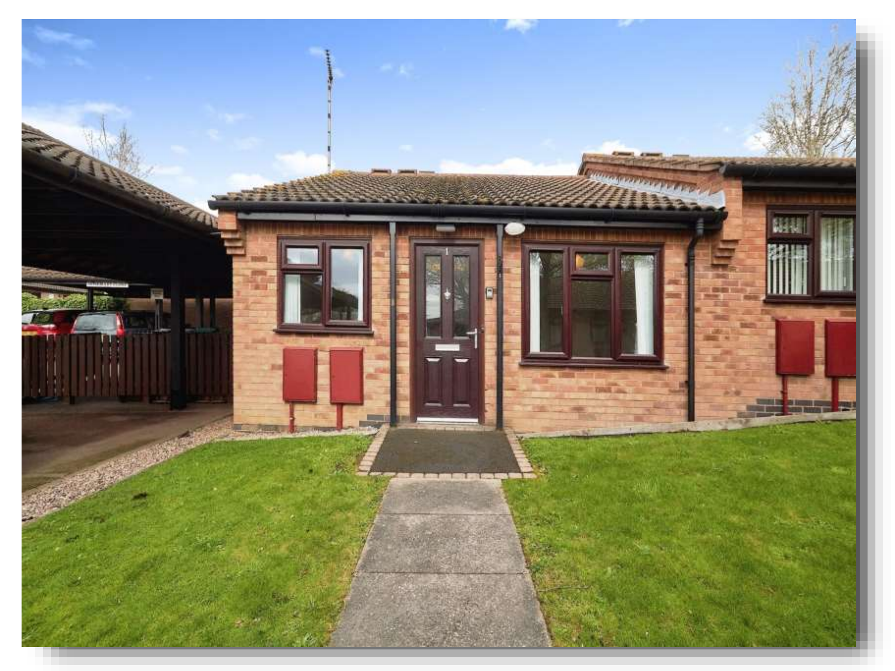
Lilac Close, Nottingham NG8 6GH