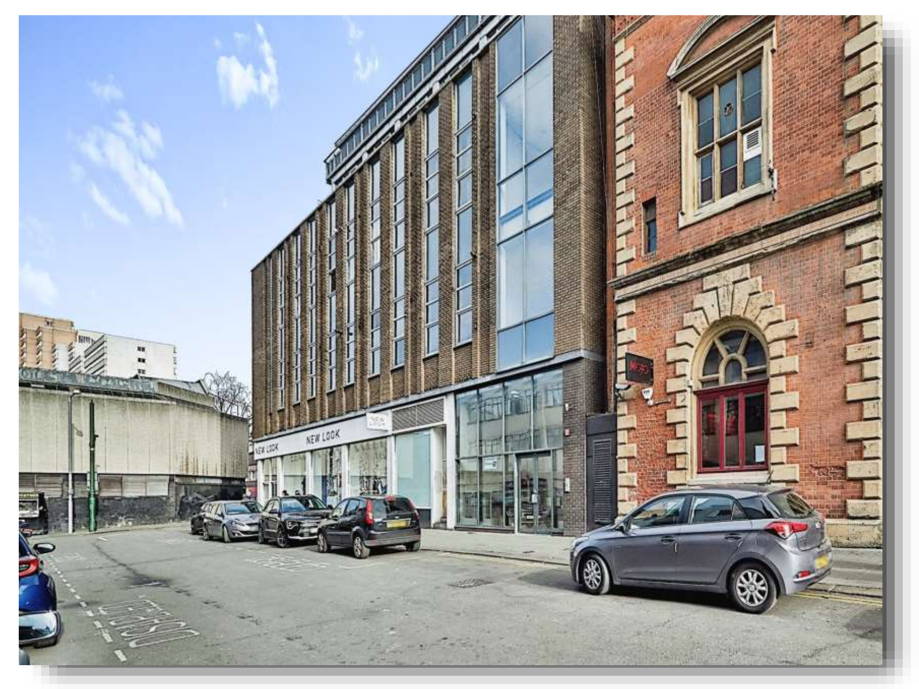
Crusader House Thurland Street, Nottingham NG1 3BT