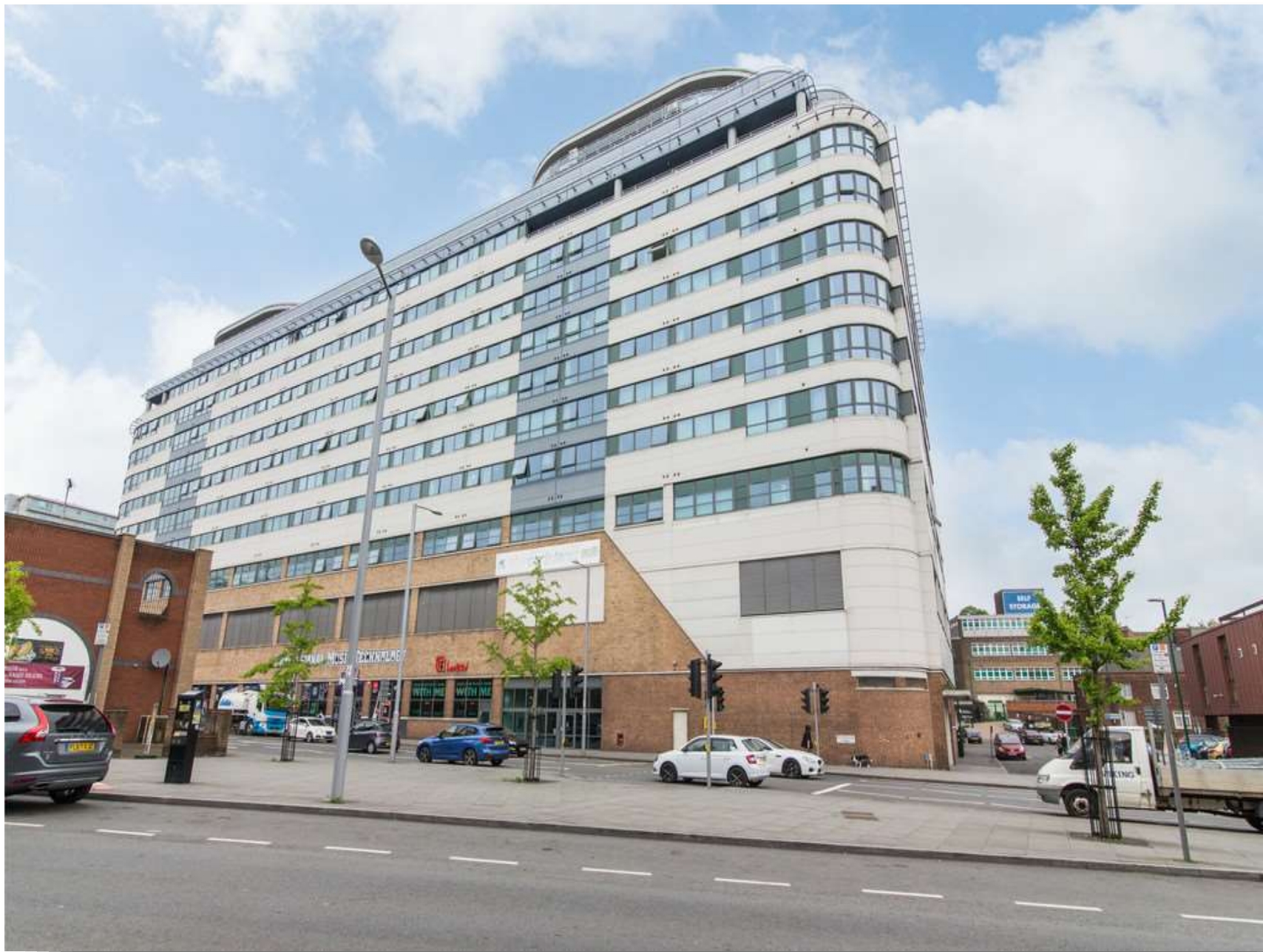
Huntingdon Street, Nottingham NG1 1AP