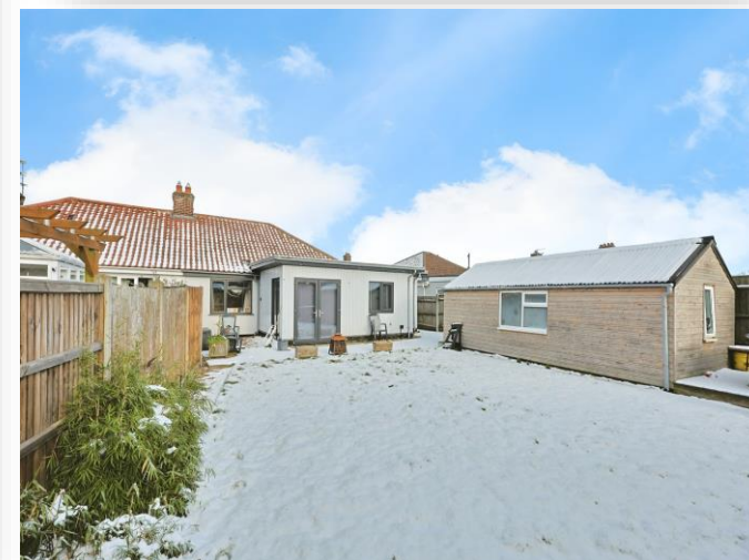
Allens Avenue, Norwich, NR7 8EP