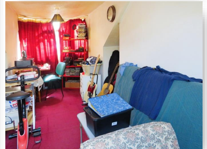
Riverside Road, Norwich, NR1 1SR