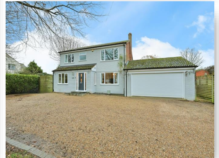
Hawthorns, Lower Green, Freethorpe, Norwich, NR13 3NP