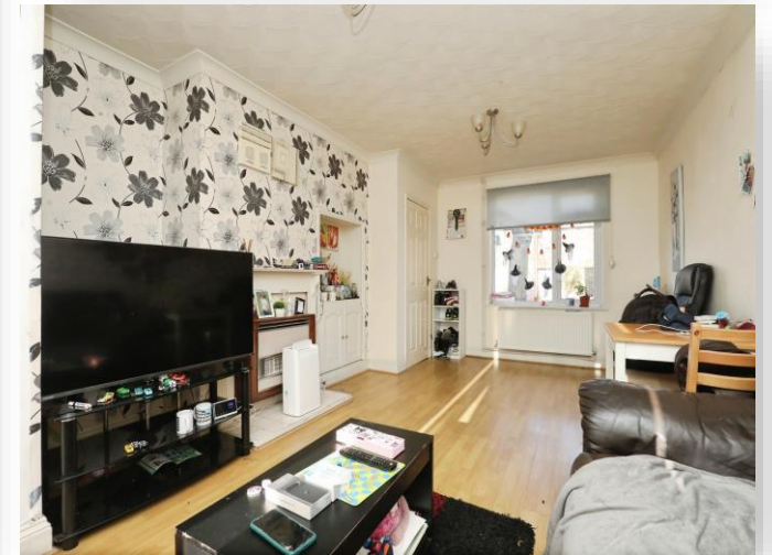
Cunningham Road, Norwich, NR5 8HH