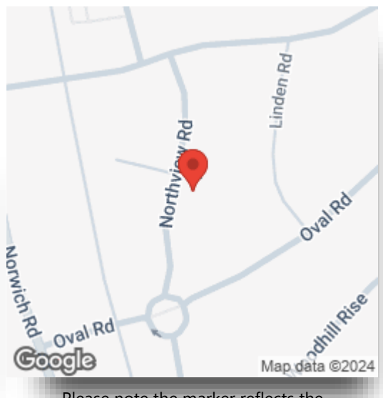
Please note the marker reflects the postcode not the actual property