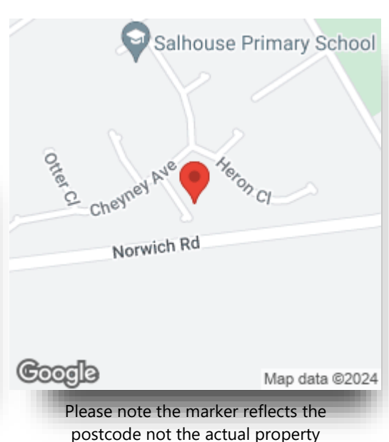
view this property online williamhbrown.co.uk/Property/NOR141086