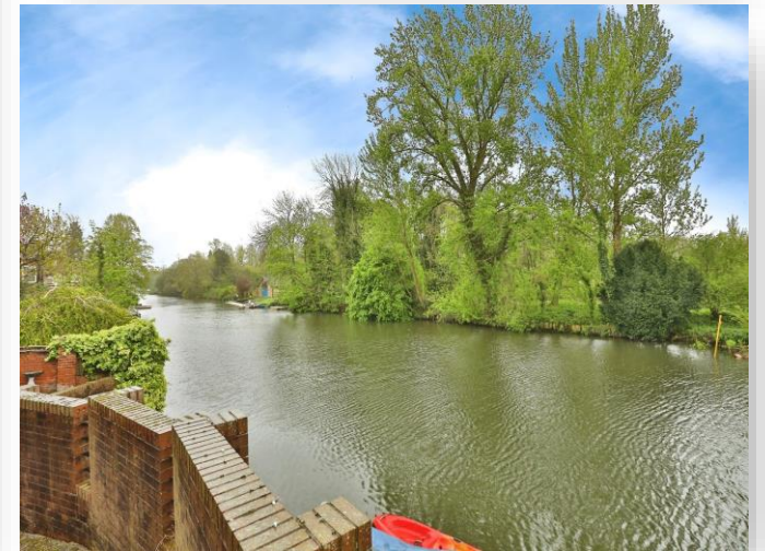
Yare Court, Yarmouth Road, Norwich, NR7 0EF