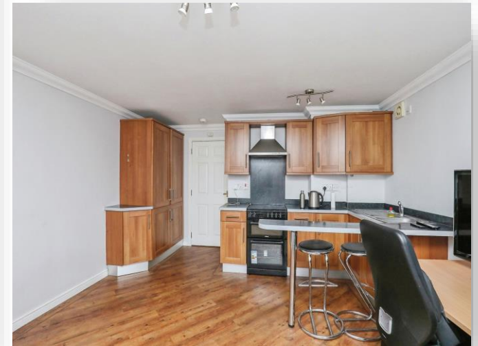
Block 1, Trafalgar Street, Norwich, NR1 3HW