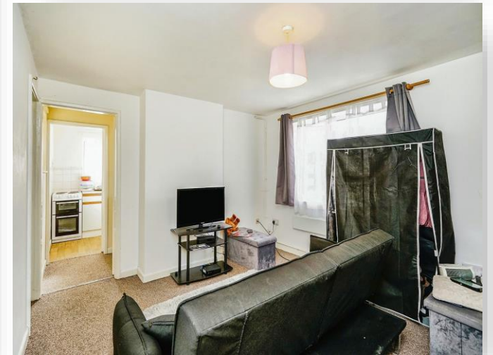
Denmark Road, Norwich, NR3 4JS