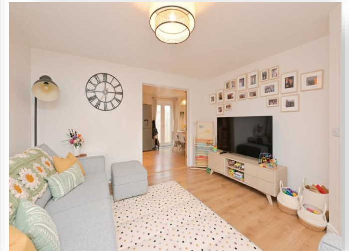
Blisworth Close, Northampton NN4 8QT