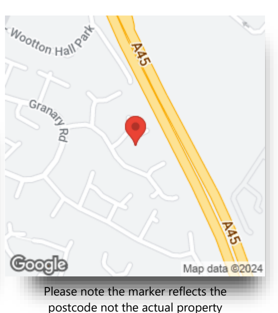
view this property online williamhbrown.co.uk/Property/NMS114652