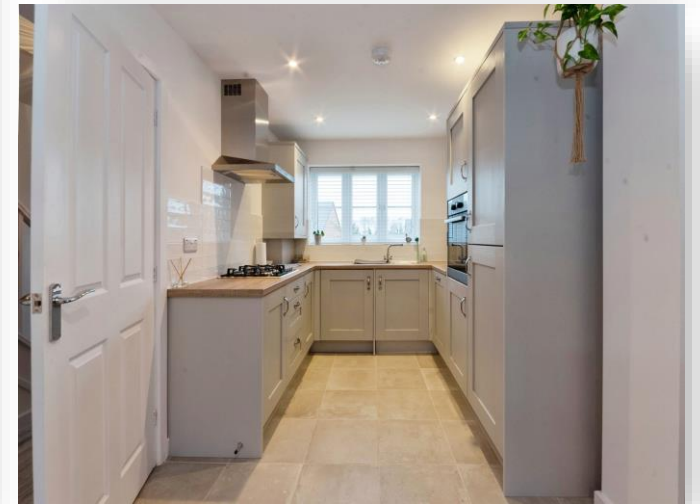
Ruston Close, Long Buckby Northampton NN6 7YB