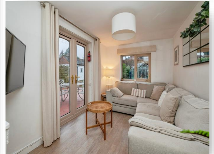
White Cottage, White Horse Lane, Briggate, North Walsham NR28 9QZ