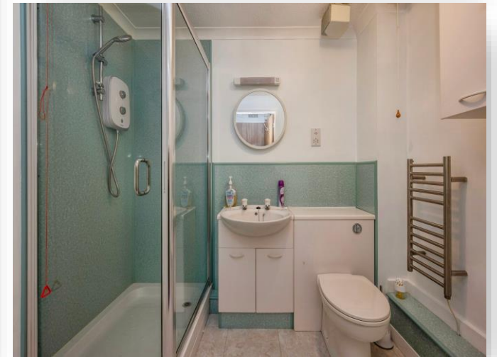
Angel Court, Cromer Road, North Walsham NR28 0UN