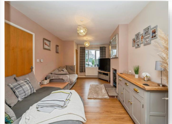
Harvey Estate, Gimingham, NR11 8HA