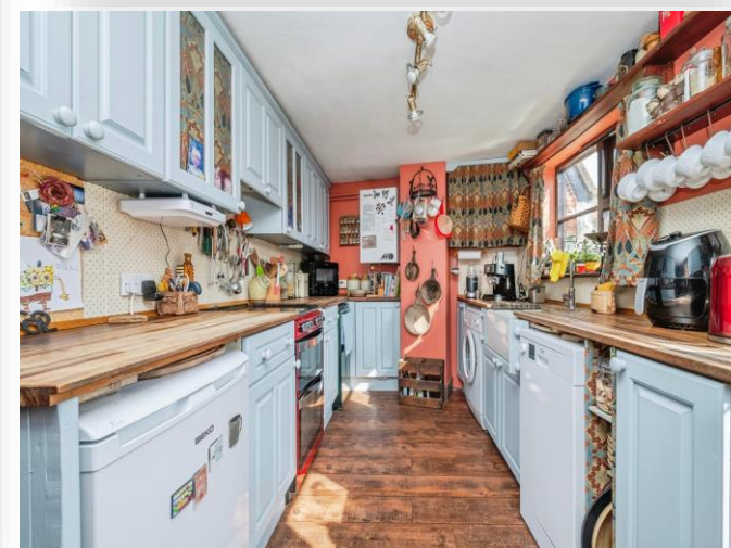
Midsummer Cottage, Happisburgh Road, White Horse Common, North Walsham, NR28 9LN