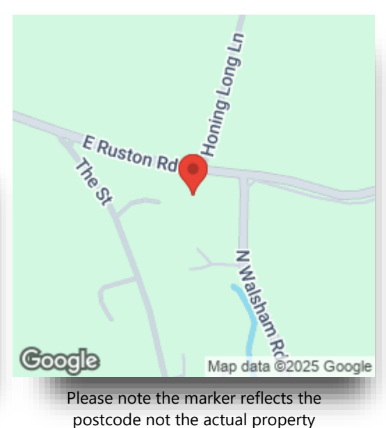
view this property online williamhbrown.co.uk/Property/NWM109193