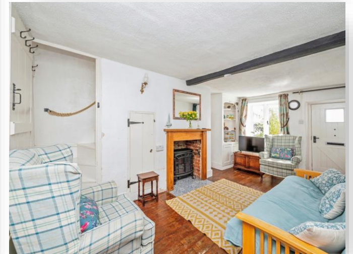
Keswick Cottages Keswick Road, Bacton Norwich NR12 0HE