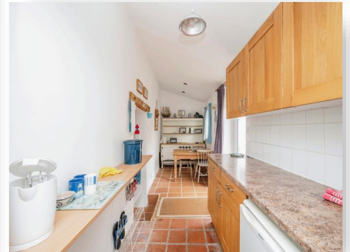
Fairview Chapel Road, Southrepps Norwich NR11 8UW