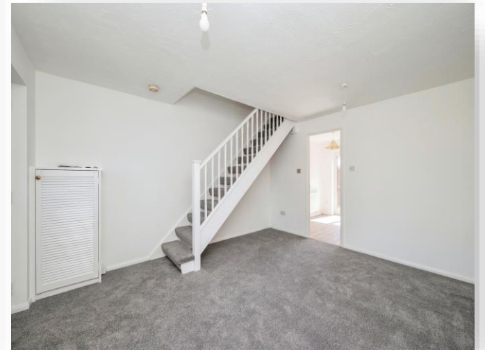
Woodbine Close, North Walsham NR28 9XS