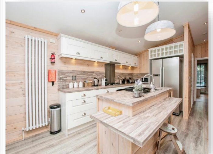
The Willows, Bacton Road, North Walsham, NR28 0RA