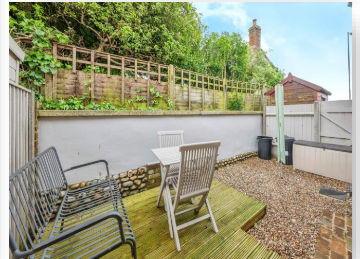
Alicia Cottages, Walcott Road, Bacton, Norwich, NR12 0HD