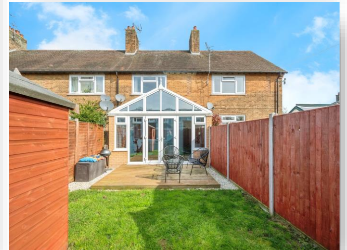
Hoveton Place, Badersfield, Norwich, NR10 5JS