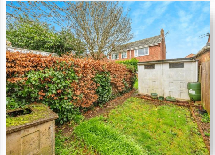
Ellinor Road, North Walsham NR28 9AG