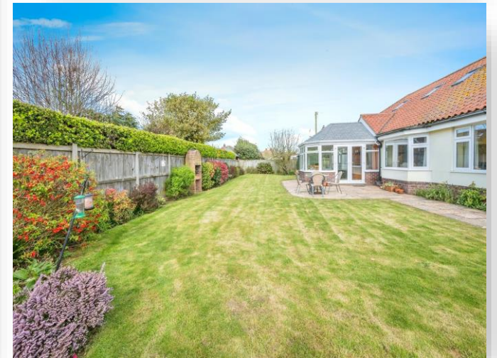
Beckmeadow Way, Mundesley, Norwich, NR11 8LR