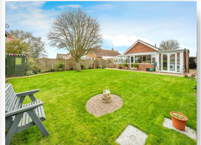
Eden Close, Bacton, Norwich, NR12 0LP