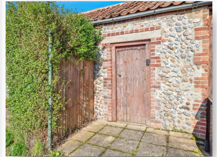
High Street, Mundesley, Norwich, NR11 8JL