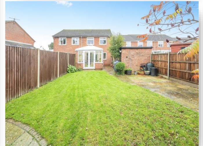
Legrice Crescent, North Walsham, NR28 9AF