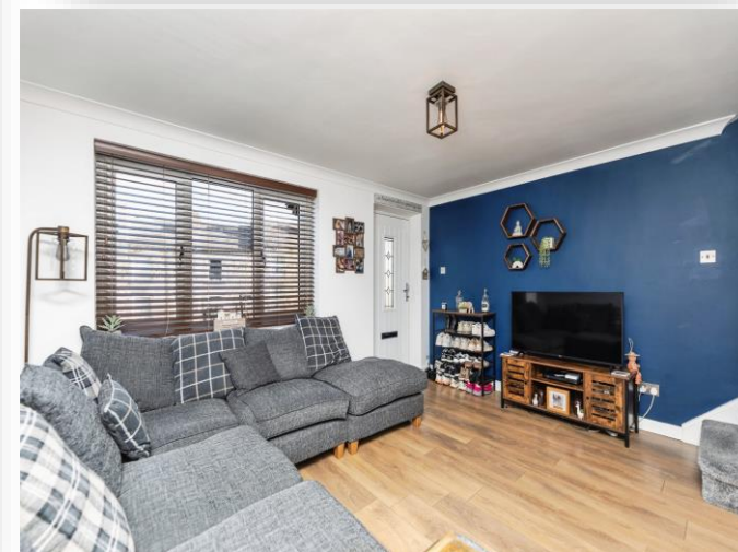
Mary Street, East Ardsley Wakefield WF3 2BW