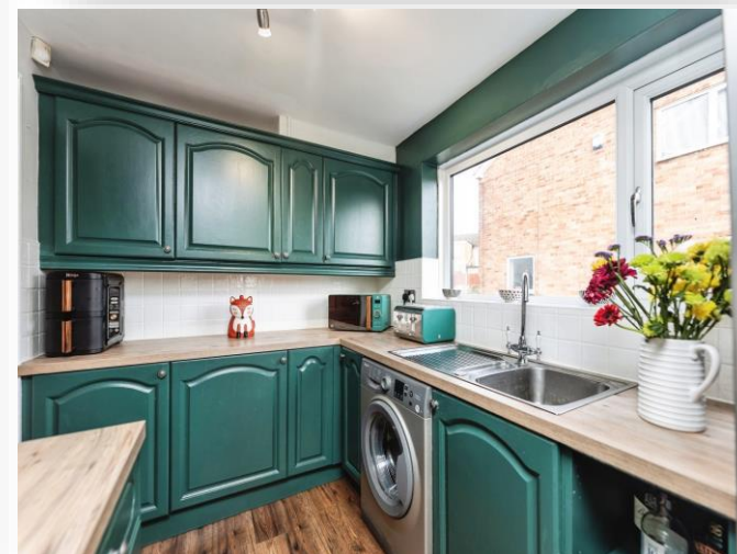
Syke Gardens, Tingley Wakefield WF3 1BJ