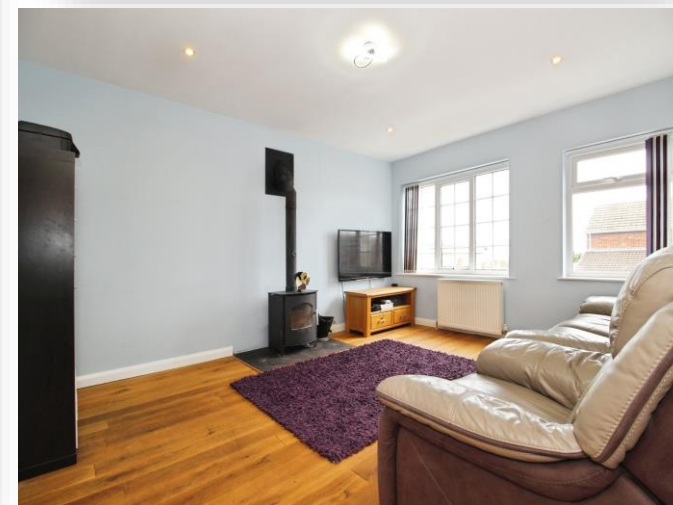
Troy Rise, Morley Leeds LS27 8JH