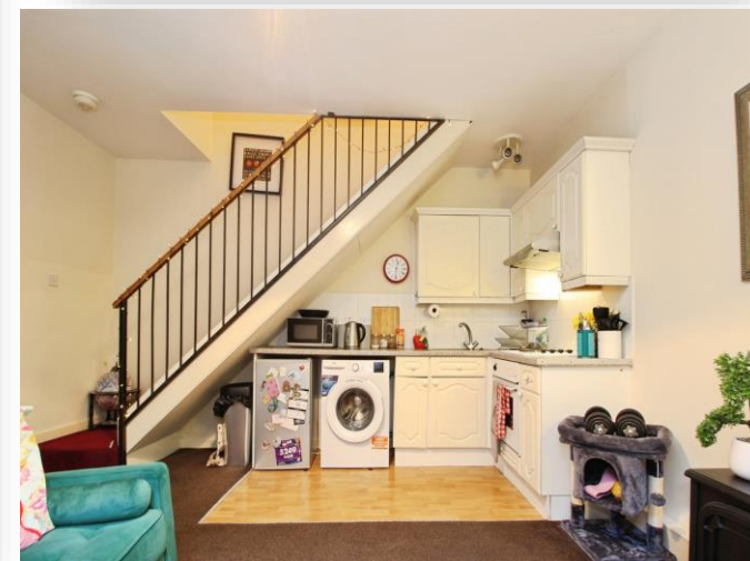
Tennyson Yard, Morley Leeds LS27 8QL