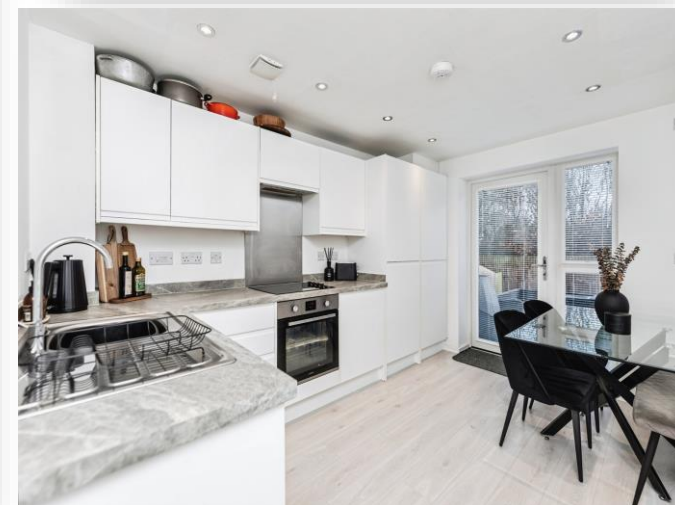
Bodmin Walk, Leeds LS10 4FU